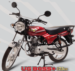
UG BOSS+ 125cc SPORT