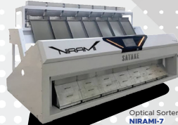
Optical Sorters NIRAMI-7