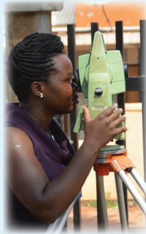
Tulina abapunta abakugu