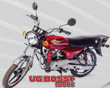
UG BOSS+ 100CC