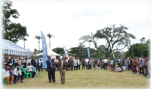
Tukuba emisomo okusomesa abantu ku nsonga z'ettaka

Mu ngeri yeemu, olwobukugu BLB bw'efunye mu kulabirira ettaka okumala emyaka 25, BLB kati ekola ne ku ttaka eritali lya Kabaka ku nsonga zonna okuli okupunta; okubalirira ettaka, okugoba ku byapa n'ebirala.