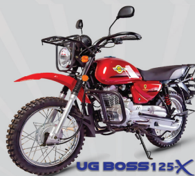
UG BOSS 125X