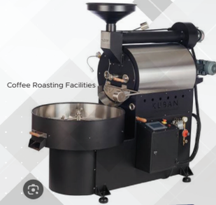
Coffee Roasting Facilities