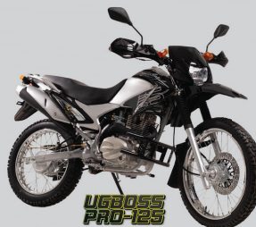
UG BOSS PRO-125