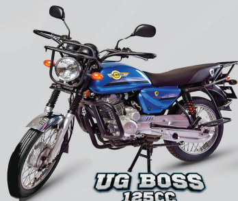
UG BOSS 125CC