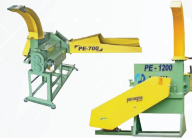
PE-700 / PE- 800 / PE-1200 Grass Choppers for Silage