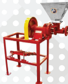
MDP-60 Commercial Grinder